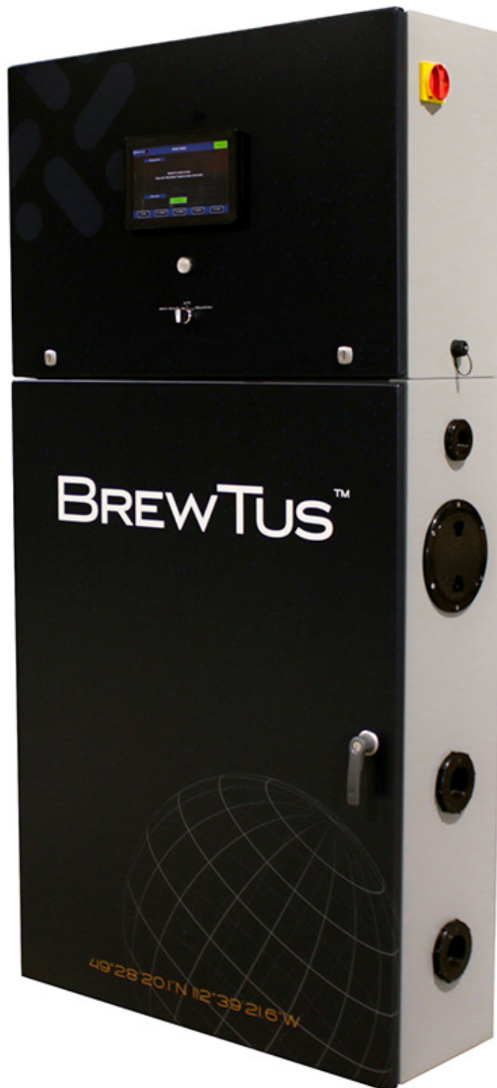
The BrewTus bioreactor.

“Historical [geosmin] levels were highly variable. Sometimes acceptable, sometimes not,” said Robinson. “The variation usually correlated to changes in water quality, the amount of new water added, fish biomass or feed rate. However, since biofilter seeding started, these changes don’t seem to have as large an impact on geosmin levels. Historically, no intervention