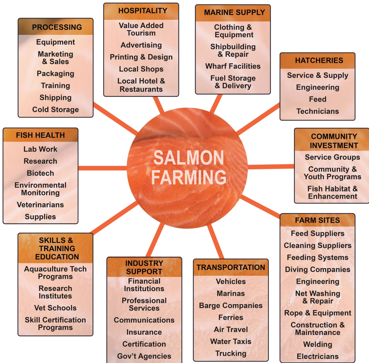
Figure 2. Salmon is job creator worldwide while occupying a fraction of ocean space in comparison to land consumption by freshwater aquaculture, and with lower carbon emissions than two of the most commonly consumed terrestrial meats. The International Salmon Farmers Association (2018) reports it produces some 17.5 billion salmon meals/year from just 0.00008% of ocean area with emissions of 2.9kg CO 2 /kg edible protein, in comparison to 5.9kg CO 2 /kg for pork, and 30.0kg CO 2 /kg for beef, creating an estimated 132,000 direct and indirect jobs [accessed 2021 Nov 04; reproduced with permission] http://www.salmonfarming.org..

and that the needs associated with marine aquaculture feeds will put more pressure on marine and terrestrial systems. This ignores the overarching imperative for expansion of all forms of aquaculture to supplant more impactful terrestrial livestock food systems (Hoegh-Guldberg et al. 2019). The term ‘carnivorous’ is misused. Candidates for aquaculture development are better classified as ‘higher trophic level fish species’ that feed higher in the aquatic food chain. The